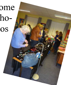
from last year's Fair