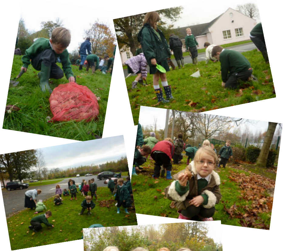
Everyone enjoying our bulb planting last Tuesday.

Phone: 3881 1649 Fax: 3883 2177 www.moyallonps.co.uk E-mail: jpriestley374@c2kni.net